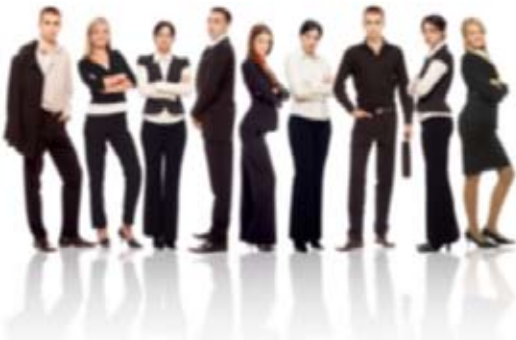
Offices & Departments